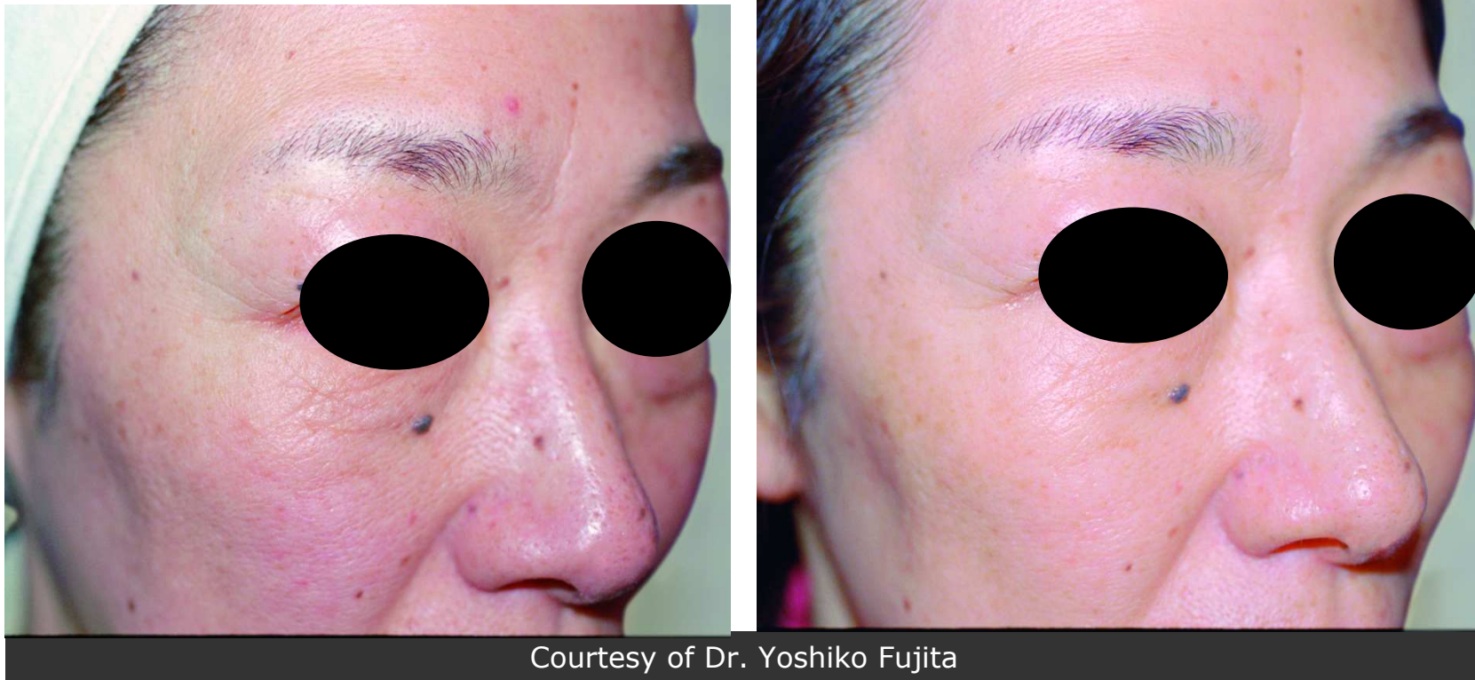
Before and after 3 treatments